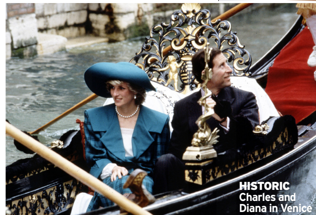
HISTORIC Charles and Diana in Venice