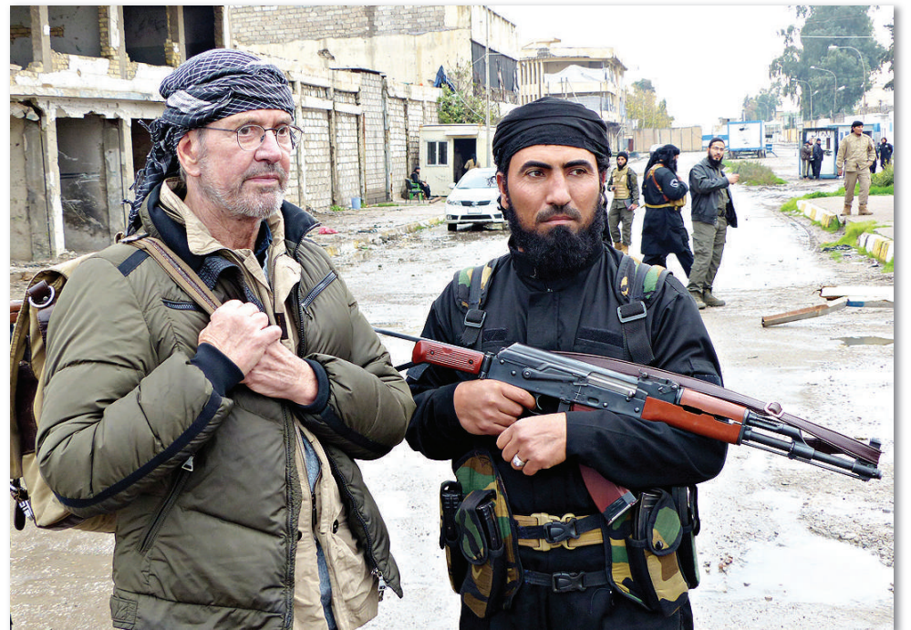
In conversation with a German member of the terror group. He says: "I will never go back there"

"They kill all the Shia Muslims they can get their hands on. I asked them but if they were prepared to kill every Shia Muslim, and they scoffed: '150 million or 500 million, we don't