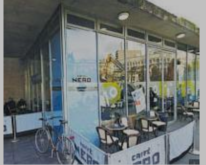
TRAVES-TEA Man was outside the café

EXCLUSIVE BY STEPHEN HAYWARD CONSUMER CORRESPONDENT